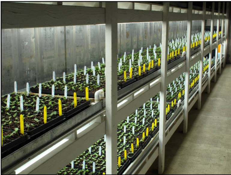
Inoculated melon seedlings in a growth room.