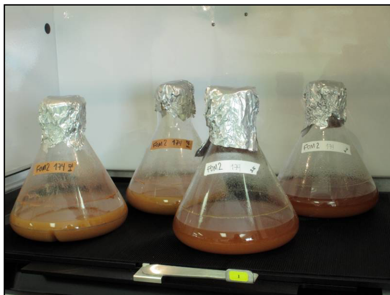
Liquid cultures of Fusarium oxysporum f. sp. melonis grown in V-8 broth.