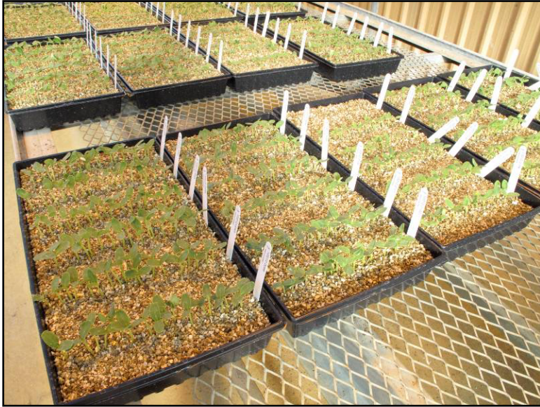
Melon seedlings grown in vermiculite.