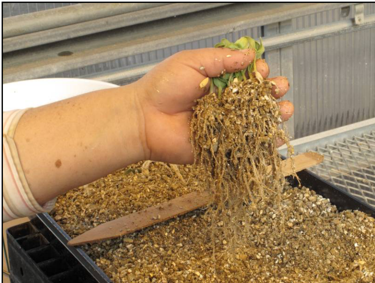
Removal of seedlings from the vermiculite.