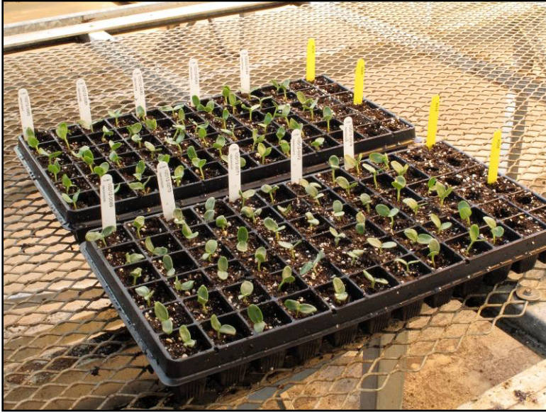
Melon seedlings transplanted into potting mix (one day after inoculation).