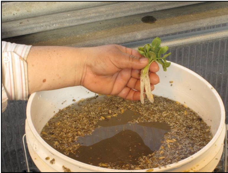
Washing off the roots.